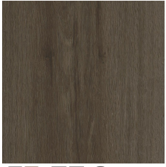
011 Tawny Ash