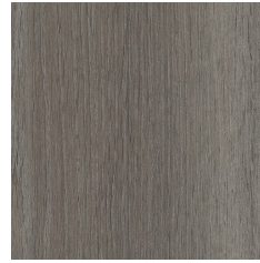
009 Silver Ash