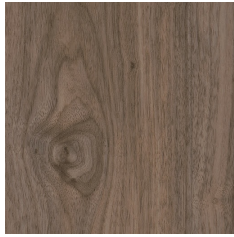
007 Danish Teak