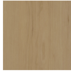
005 Northern Birch