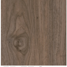
007 Danish Oak