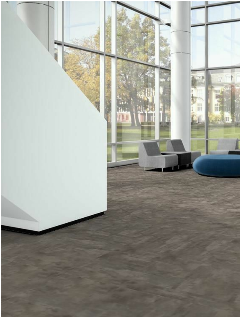
Installation Methods: Parquet, Herringbone, Basketweave, Ashlar