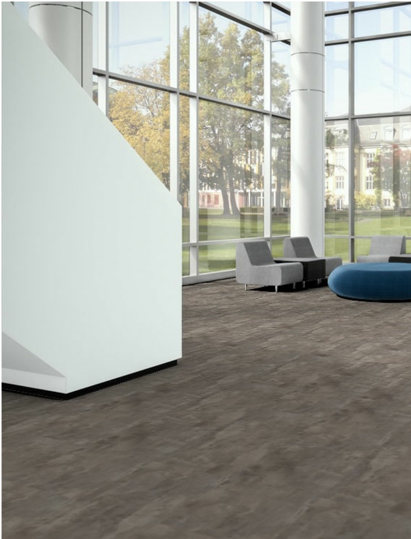
Installation Methods: Parquet, Herringbone, Basketweave, Ashlar