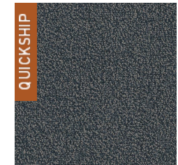
2653 Blue Streak