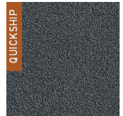
2653 Blue Streak