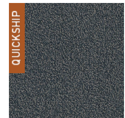
2653 Blue Streak