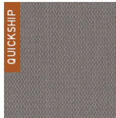
SHU54 Silver Grey