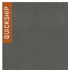
RMX54 Silver Grey