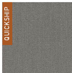
REM54 Silver Grey