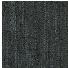
PLE49 Ditto Paper