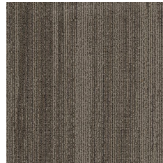
PLE76 Butcher Pa..