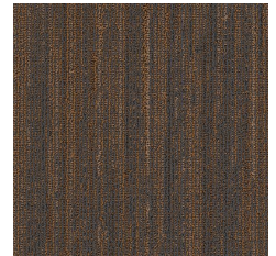
PLE77 Card Stock