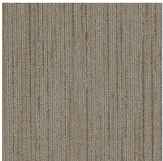
PLE12 Rice Paper