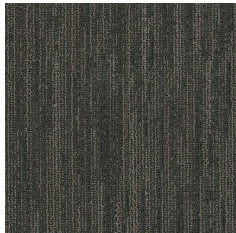
PLE59 Carbon Pap...