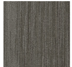
PLE55 Tracing Pap..