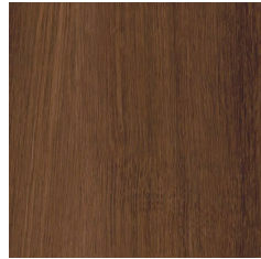
004 Autumn Leaf