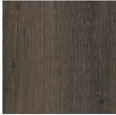
008 Suede Gray