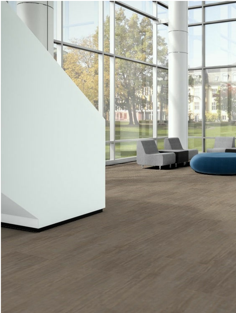
Installation Methods: Herringbone, Ashlar