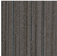
LNA55 In A Row Acc...