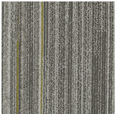
LNA53 Pipe Accent