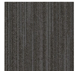
LNE54 In A Row