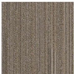
LNE12 Fine Point