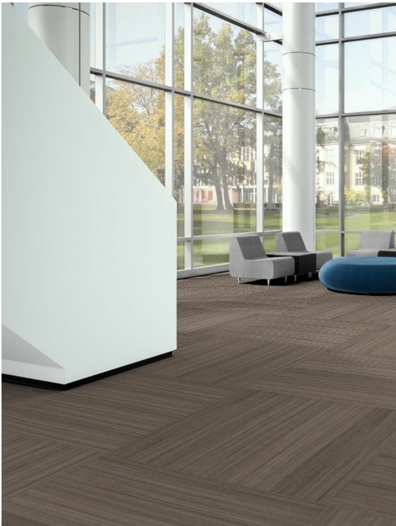
Installation Methods: Parquet, Herringbone, Basketweave, Ashlar