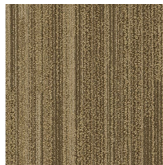
LNE23 Split Rail