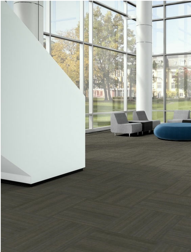
Installation Methods: Brick, Monolithic, Ashlar, Quarter Turn