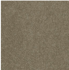
HIL75 Gentle Taupe