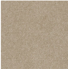
HIL15 Soft Beige