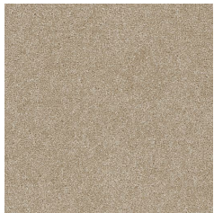
HIL15 Soft Beige