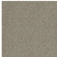
HIL51 Cool Grey