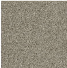
HIL51 Cool Grey