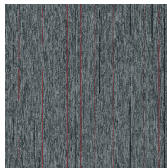
GAM54 Hat - Trick