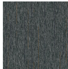
GAM58 Hot Shot