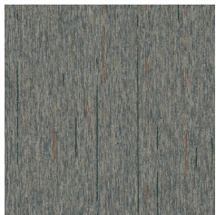
GAM14 Wild Card