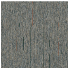
GAM14 Wild Card