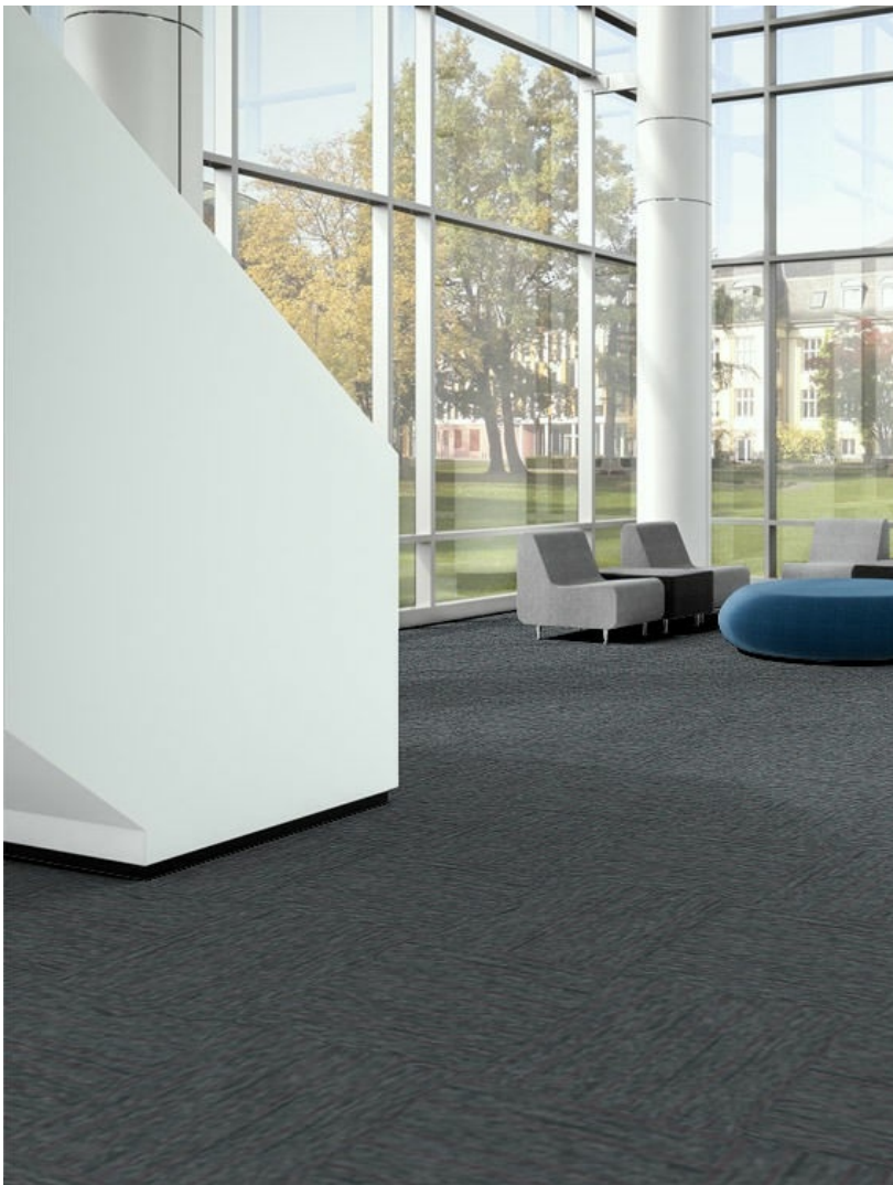
Installation Methods: Brick, Monolithic, Ashlar, Quarter Turn