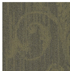
FLW35 Citron Weft