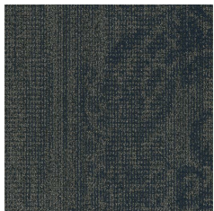
FLW48 Navy Braid