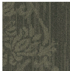
FLW37 Jade Floss