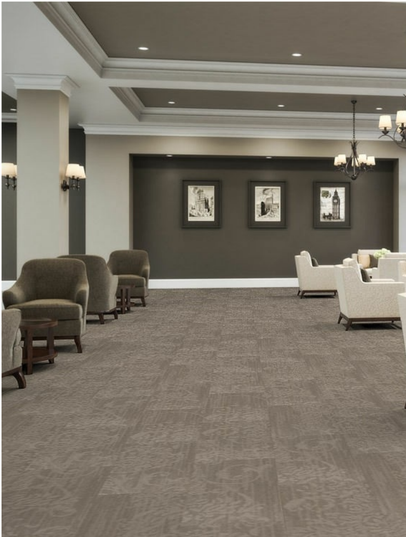
Installation Methods: Herringbone, Basketweave, Ashlar