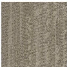
FLW11 Open Weave