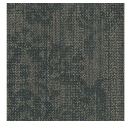
FLW44 Blue Treadle