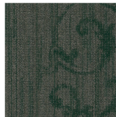
FLW38 Emerald Tr..