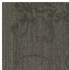
FLW55 Grey Bobbin