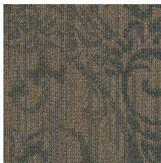
FLW25 Gold Thread