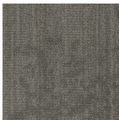
FLW53 Silver Warp