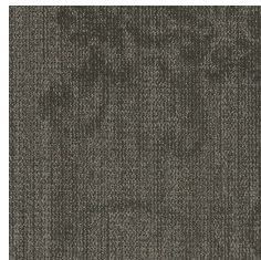
FLW55 Grey Bobbin