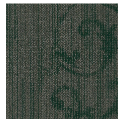
FLW38 Emerald Tr..