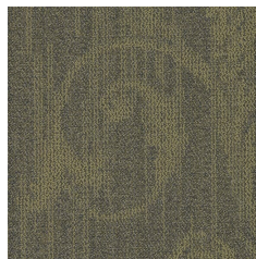
FLW35 Citron Weft