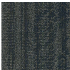
FLW48 Navy Braid