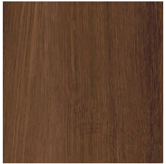
004 Autumn Leaf