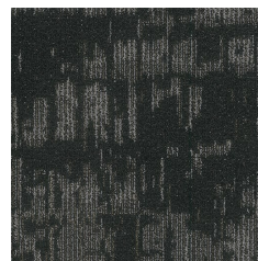
ESP57 Starry Night