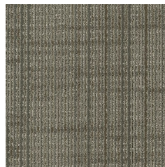
CSS72 Knitting Nee...