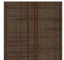
CSS86 Shuttle Bro...