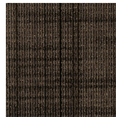
CSS77 Tapestry Ta...