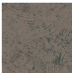
CNK37 Sea Breeze