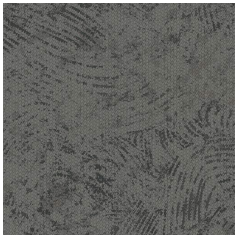
CNK74 Winds of Ch...