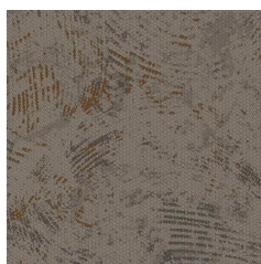
CNK24 Desert Wind