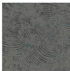
CNK44 Fresh Air