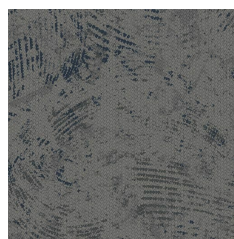
CNK48 Winter Wind