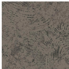
CNK77 Gentle Bre...