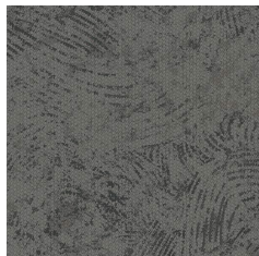
CNK74 Winds of Ch...