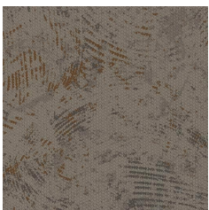
CNK24 Desert Wind