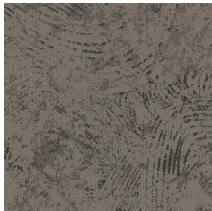
CNK77 Gentle Bre...