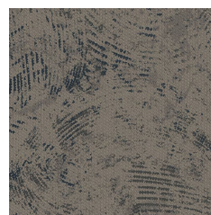
CNK49 Wind Swept