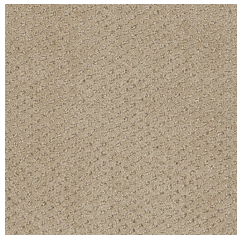
ALP15 Soft Beige