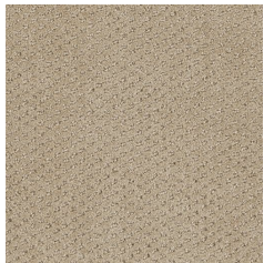
ALP15 Soft Beige