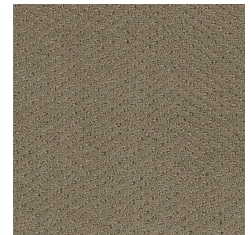
ALP75 Gentle Tau...