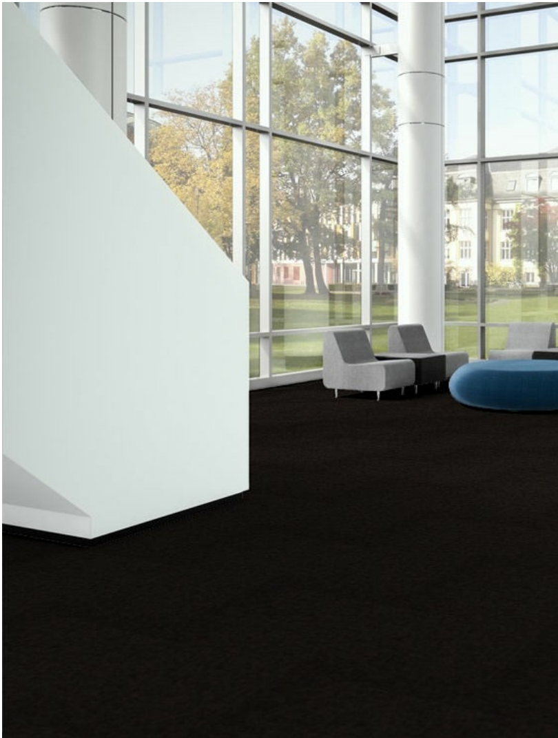
Installation Methods: Monolithic, Quarter Turn